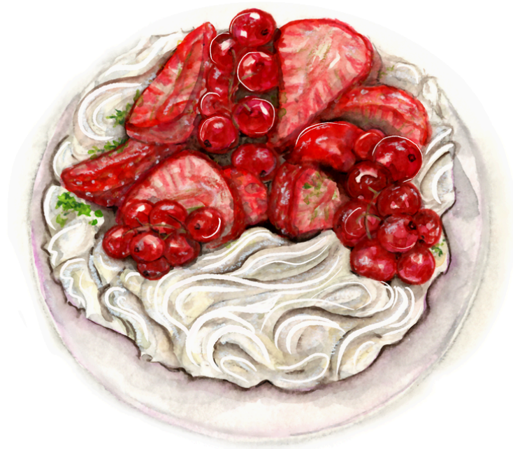
Summer Berry Jolly Pavlova